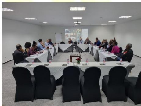
Fig 2: Some of the participants at the GM in Marrakech.

Link to other photos: http://bit.ly/3wbYbFy