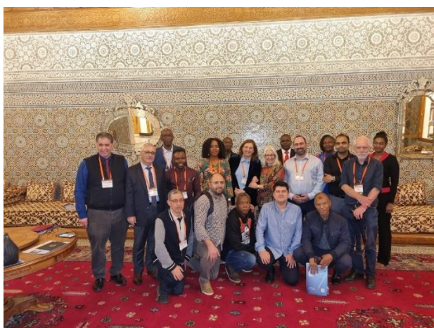
Fig 1: AGM attendees